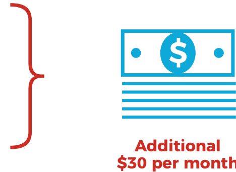
Minority and low income consumers could see their bills go up as much as $30 a month 3